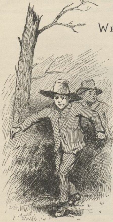
THEY TIP-TOED ALONG.

WE went tip-toeing along a path amongst the trees back towards the end of the widow's garden, stooping down so as the branches wouldn't scrape our heads. When we was passing by the kitchen I fell over a root and made a noise. We scrouched down and laid still. Miss Watson's big nigger, named Jim, was setting in the kitchen door; we could see him pretty clear, because there was a light behind him. He got up and stretched his neck out about a minute, listening. Then he says,